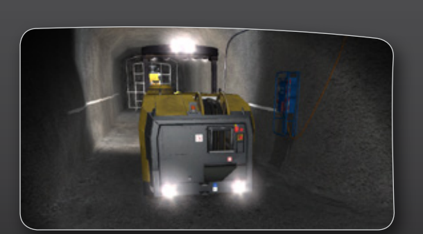
Connecting to Site Services

CONVERSION KIT<sup>®</sup> COMPATIBLE WITH