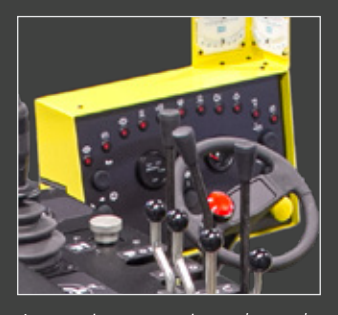
Accurate instrumentation and controls provide a safe and highly realistic training environment