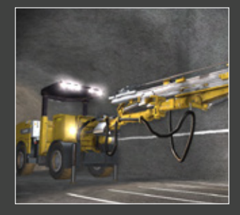
Machine dynamics faithfully reproduced to give the maximum realism

With mining equipment becoming increasingly technically sophisticated, the level of information, experience and organizational competencies required to accurately simulate these machines also increases. Through Immersive Technologies' industry experience, you can be assured your training solution will be the only accurate and true representation of the real machine available.